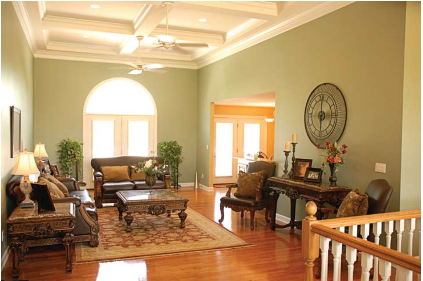
OPPOSITE PAGE, LEFT: A silk floral arrangement adds an elegant touch on the coffee table. OPPOSITE PAGE, RIGHT: A red felted pool table is ready for play in the home's lower level. ABOVE: Natural light floods the great room. RIGHT: Red walls create a lively frame, while a column-flanked arch and open walls give an airy feel.

The couple, owners of Howard's ATA Black Belt Academy, lost their west-side home to a fire in May 2006. "The fire marshal said either a lightning strike or gas fumes caused it," Rob explains.